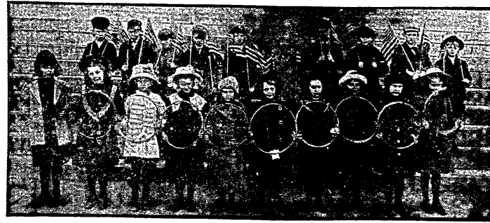
NETTLETON SCHOOL, INDIAN CLUB DRILL.