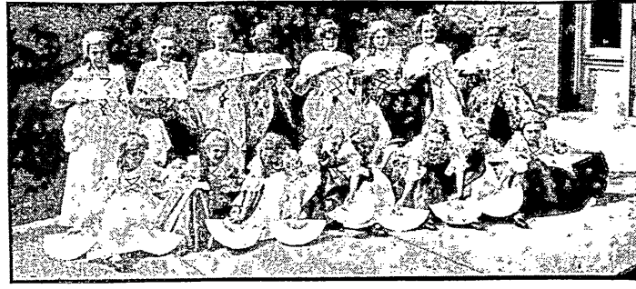
ADAMS SCHOOL, SCARF DRILL.