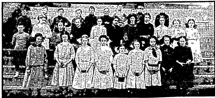
NETTLETON SCHOOL, MINUET.