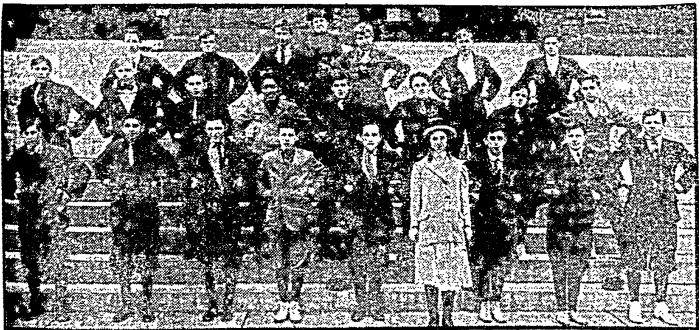
JACKSON SCHOOL, WAND EXERCISE.